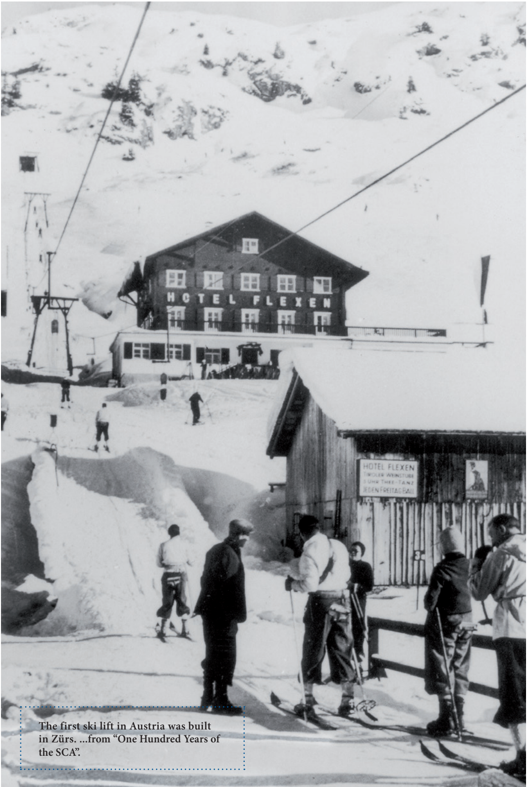
The first ski lift in Austria was built in Zürs. ...from "One Hundred Years of the SCA".